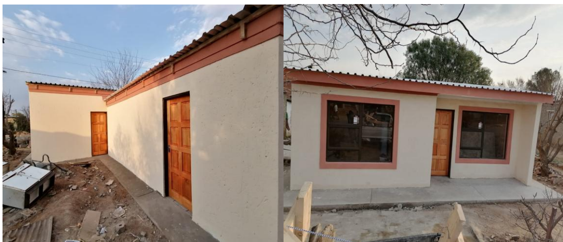
Figure 1: Newly constructed house (donated) 3*8*0 Freedom Square Ward 6"

Attached: Pictures of the donated house.