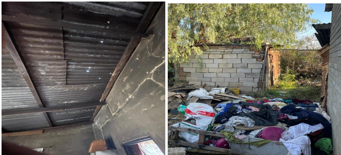
Figure 1: Burnt down dilapidated house (before construction)

be pregnant at the time, to an extent where she gave birth prematurely. In addition to this, the drug abusing youngsters has also burned down part of the house as a result of their conditions.